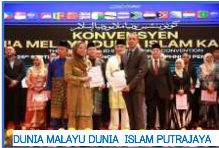
DUNIA MALAYU DUNIA ISLAM PUTRAJAYA