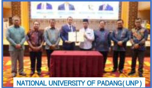
NATIONAL UNIVERSITY OF PADANG(UNP)