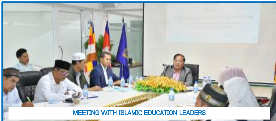
MEETING WITH ISLAMIC EDUCATION LEADERS