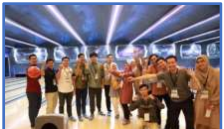
CAMBODIAN-MALAY YOUTH EXCHANGE.