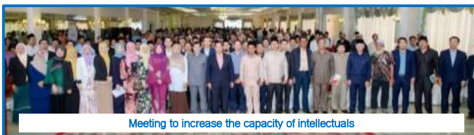
Meeting to increase the capacity of intellectuals