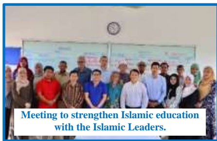
Meeting to strengthen Islamic education with the Islamic Leaders.

MEETING TO STRENGTHEN ISLAMIC EDUCATION WITH THE ISLAMIC LEADERS: Conduct Meeting with Islamic Leader for promoting the Structure management and Confederation law for Islamic teacher and Management Teacher in the School.