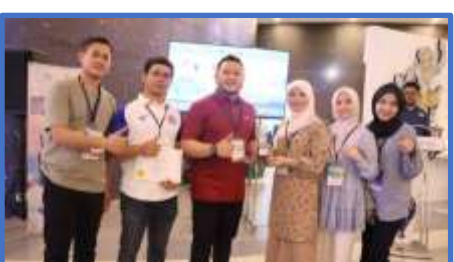
CAMBODIAN-MALAY YOUTH EXCHANGE.