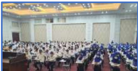
YOUTH CAPACITY BUILDING.