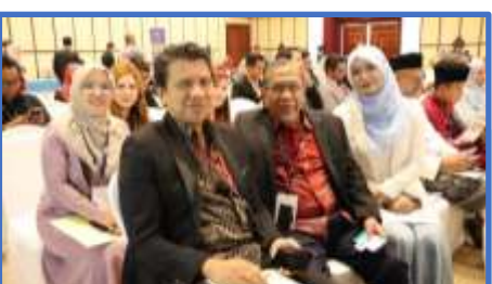
YOUTH CAPACITY AND SOCIAL ACTIVITIES.