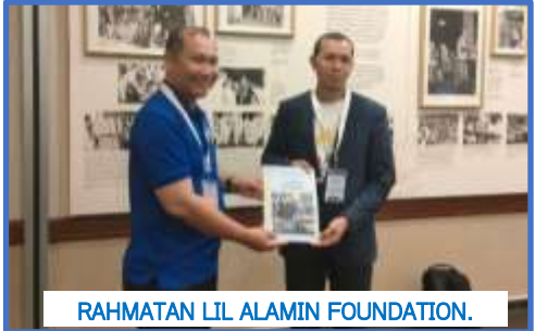
RAHMATAN LIL ALAMIN FOUNDATION.