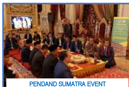
PENDAND SUMATRA EVENT