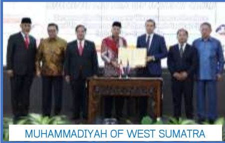
MUHAMMADIYAH OF WEST SUMATRA