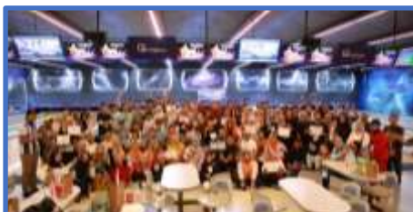
YOUTH EXCHANGE PROGRAM.